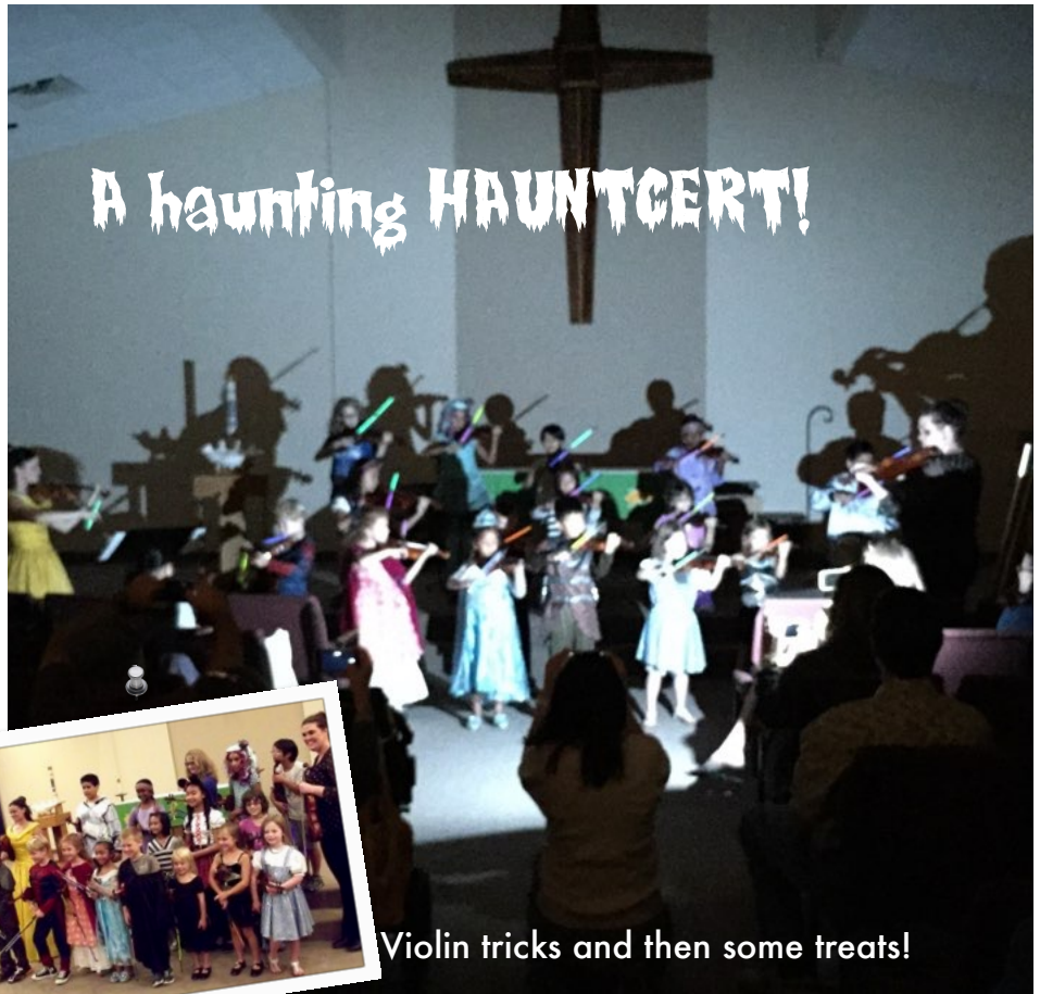
Violin tricks and then some treats!

SOUTHEAST TEXAS SUZUKI ASSOCIATION SOUTH/SE REGION 2015-16 ISSUE NO.3