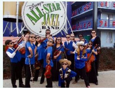
Walt Disney World, Orlando, Florida